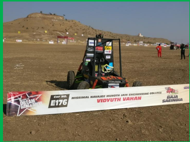
Fig.-Team Members of Vidyuth Vahan with the vehicle Fig.-Photo of the eBAJA buggy.