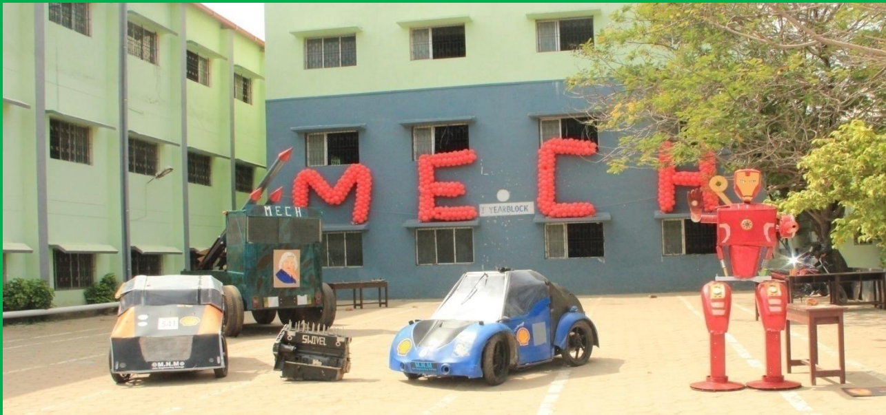
1. Updated MNM Sumo Robo 2. Water Rocketry Event 3. Models by MNM Students. (From Right Top –Clockwise)