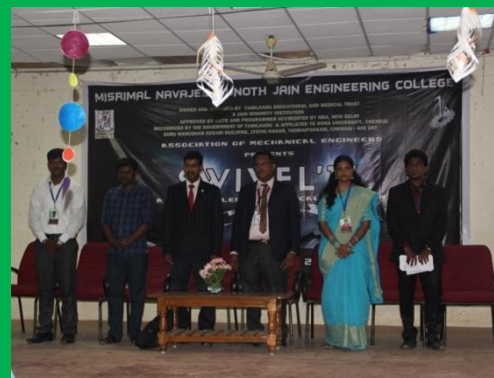
Dignitaries for the day.